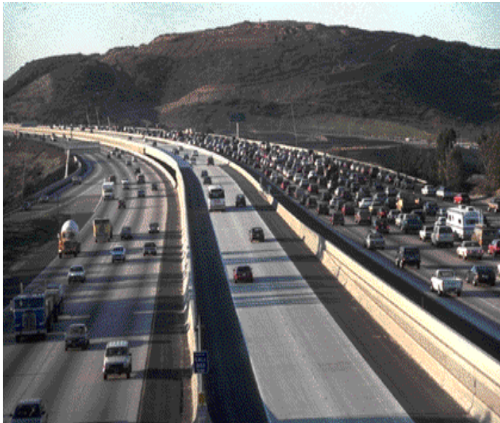
Figure 1. I-15, San Diego, CA

Motorists who take advantage of the QuickRide cite flexibility as an incentive for using the program. These projects offer examples of how altering operating scenarios can maximize the efficiency of the transportation system. Agencies operating the programs are able to move more people and goods in a more efficient manner utilizing the available capacity of the transportation network. Agencies also have the flexibility to adjust operations quickly to respond to incidents or, over a longer time