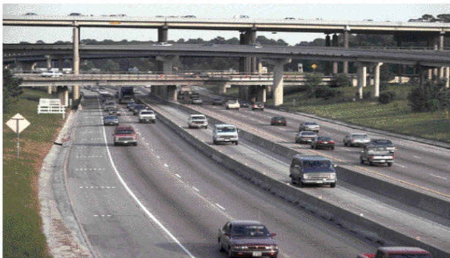
Figure 2. I-10 Katy Freeway, Houston, Texas

Each project has unique characteristics and TxDOT is approaching each in a way that meets the travel needs in the corridor and is consistent with community objectives. It is part of TxDOT's ongoing effort to explore alternatives that will maximize the efficiency of the system and balance demands with the desires of the communities that the roadways are to serve. Managed lane projects provide options in meeting these challenges.